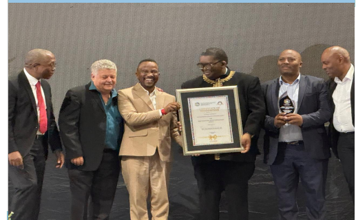
UMEDA WON TWO AWARDS: PAGE 16