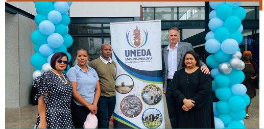
BROOKSIDE MALL EXPANSION : PAGE 13