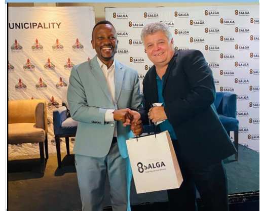
INVESTMENT ROADSHOW: PAGE 18